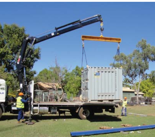
Onsite Training in Booroloola for the Mabungji Aboriginal Resource Association.

Our humble presence in Darwin continues to punch above its weight with loads of training courses delivered at home and away. In July we had trainers in and out of the remote communities of Maningrida and Borroloola.