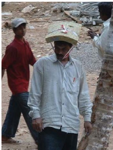
The customised moulded foam safety helmet from India