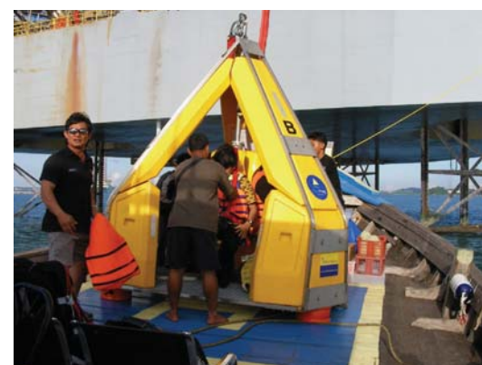
Abang (Megamas Training Assistant) just off the Frog