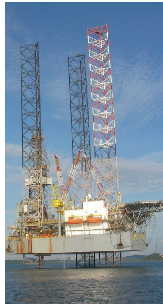
Deep Driller 8 off Batam Island, Indonesia

AST Trainer Laurie Wine sent in a few photos of the Deep Driller 8 off Batam Island where AST/Megamas recently completed some training onboard.