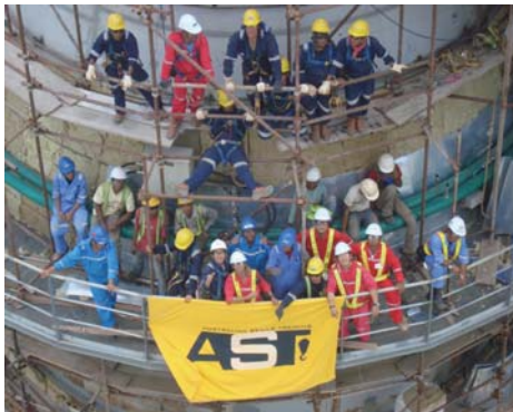
AST and Kaefer crew on top of the Gas Cooling Tower Scaffold at the Lokngan Cement in Banda Aceh