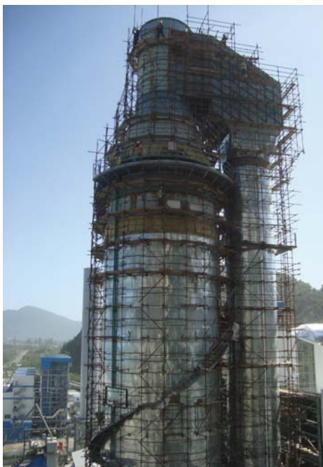
The completed job!