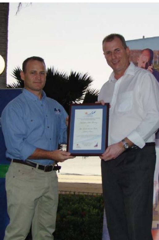
AST receives a certificate from the NT Chief Minister inducting AST into the ICBN Hall of Fame

AST was also presented with a Certificate as an inductee to the International Business Councils Hall of Fame in recognition of our export success in 2009.