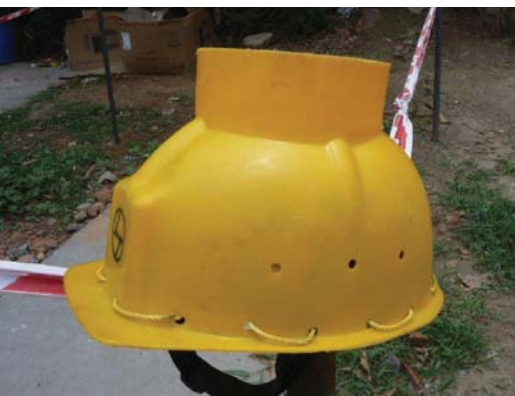
The Indian tool holding safety helmet!

Note sure if it would comply with Australia Standards, but a good idea from those Indian chaps!